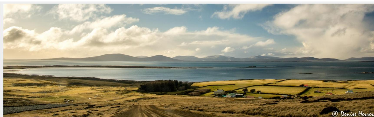
The view into Hill Cove and Saunders – a value of natural beauty.